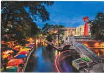
San Antonio River Walk

Additional information concerning this meeting will be forthcoming as the meeting date draws nearer.