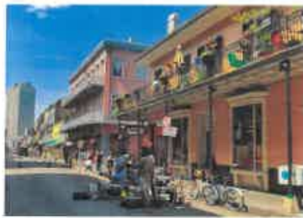
New Orleans French Quarter

Keep an eye on further updates as we get nearer to this event.